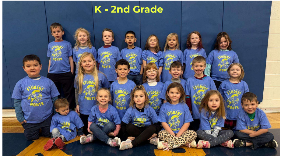
K - 2nd Grade