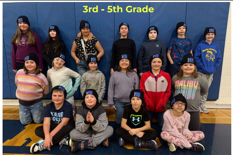
3rd - 5th Grade

3 rd , 4 th , & 5 th grade girls at Morley Stanwood Elementary are invited to our annual Special Person Dance. Bring your special person and enjoy an evening of desserts & dancing. The dance is 6-8pm on February 22 nd here at our school. Tickets are on sale for $25 per couple. Please return completed form with payment by February 18th.